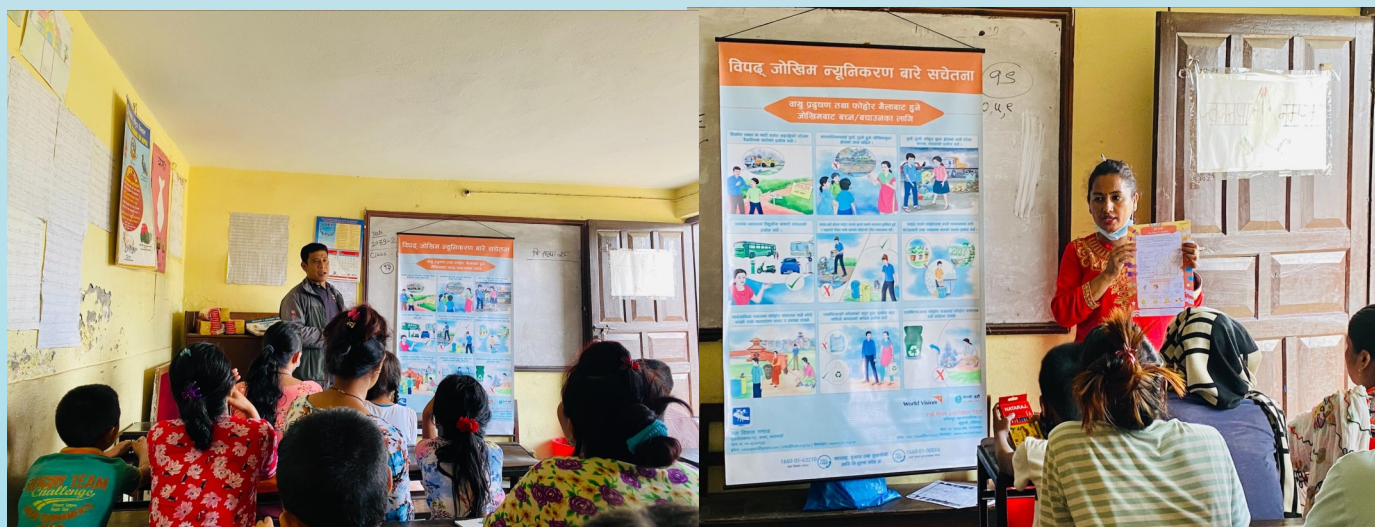
Massaging to RC and parents on DRR at the CEW event

At the CEW event conduction to RC, Disaster Risk Reduction (DRR) messaging to the participants on the issues of firing and environmental pollution and waste management. Messages are presented with text message, pictorial in these issues. participants gain knowledge of preventative and curative precaution in these subjects.