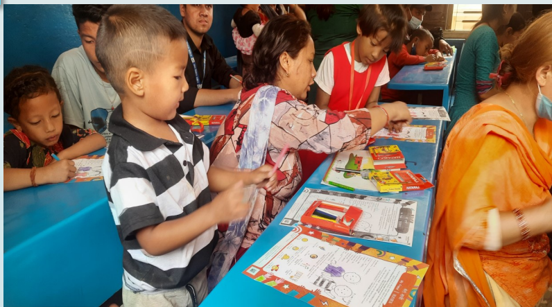
Over 83 Registered Children participated in the CEW event