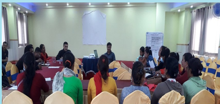
Meeting with BRiCKK staff team

Care program The program was formally commenced with a short introduction from all the participants. The meeting Session was mainly moderated by BRiCKK Project Specialist from World Vision, and the keynote and remark were noted by program officer.