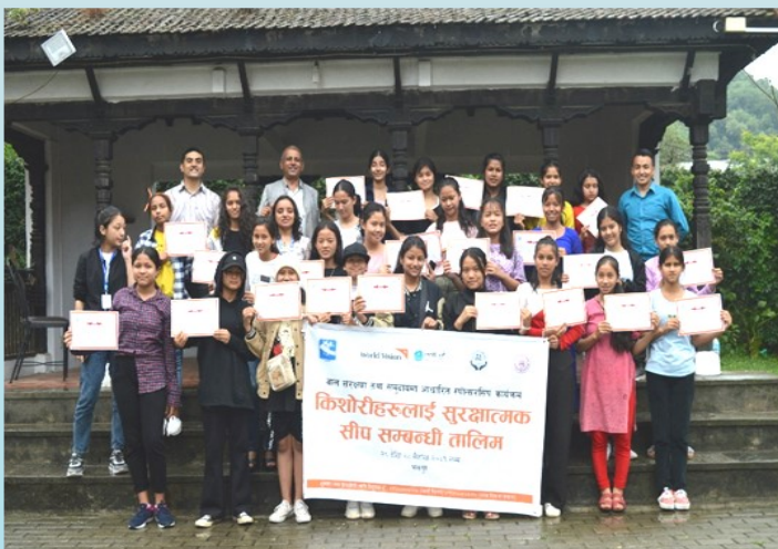
A snapshot after the training completion

The objective of the training was to encourage the adolescent girls and empower them through protective skills so as these trainees can train other girls in their communities. A total of 50 girls have successfully completed this training and have made a commitment to teach these protective skills among the school and community groups. Targeting any kind of abuses and harms, that may make itself visible in theirs and others lives.