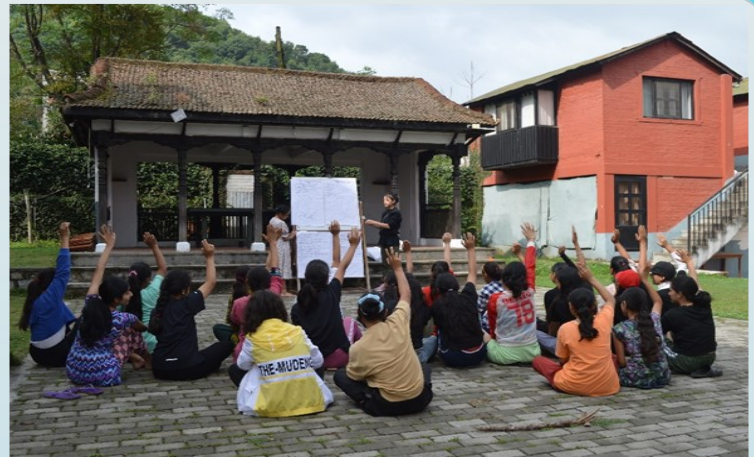
Several sessions were conducted in the training

A Protective Skills Training was organized for adolescent's girls aged between 13-18, belonging to Kathmandu Metropolitan City ward No.16 on 9-11 of May and on 20-22 May 2022 for the adolescents from Kirtipur Municipality. Altogether 50 girls who are Most Vulnerable (MV) and Registered Child (RC) from our Area Program.