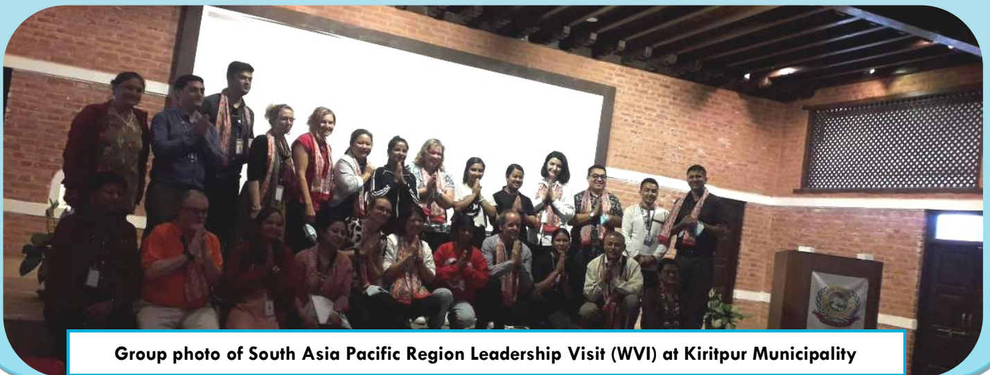
Group photo of South Asia Pacific Region Leadership Visit (WVI) at Kirtipur Municipality