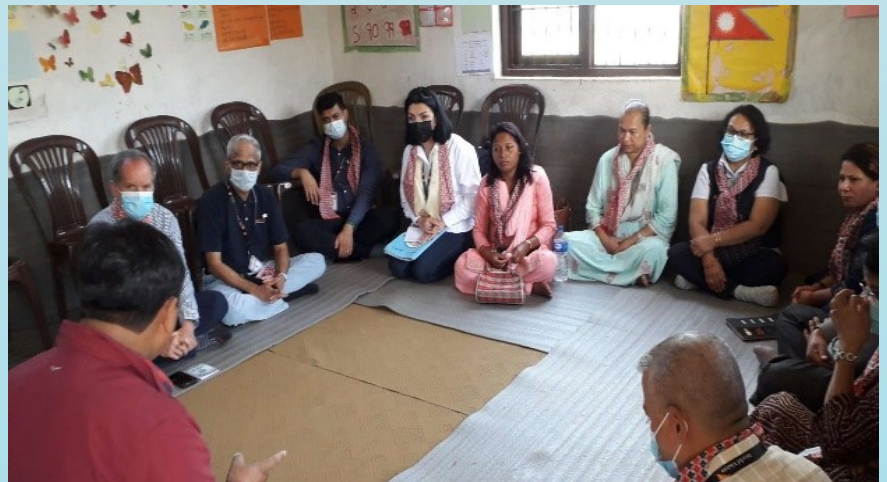
Project Officer of WVIN facilitating during the interaction with local government & stakeholders at brick industry

While visiting one such brick industry at Chandragiri Municipality, families of - Daycare centre, past and current working vocational trainees, participants linked to formal saving accounts, safety and health committee representatives, and children all who shared their experiences. These reflections were based on the positive impact that had been brought in their lives.