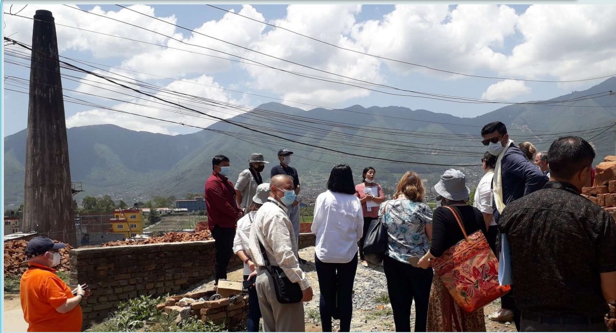
WVIN leaders visiting one of the brick industries at Chandragiri Municipality

On 23rd & 24th May 2022, the global advocacy and regional leadership team of WVIN visited the project sites i.e. Chandragiri Municipality, Kirtipur Municipality and ward 16, Kathmandu Metropolitan City. The team got an opportunity to observe and interact with the project participants.