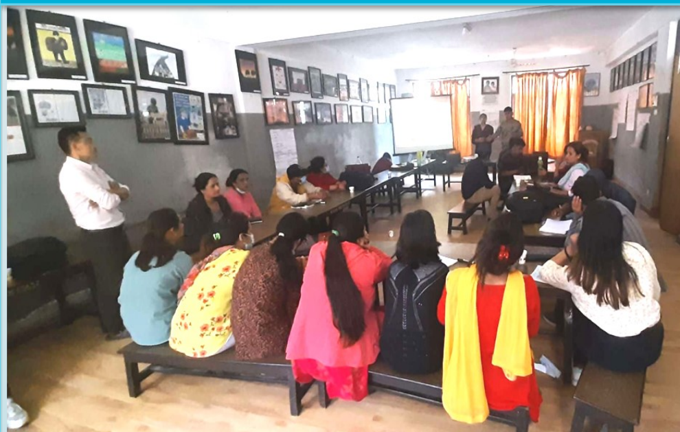
In total 19 participated in the CEFS Training