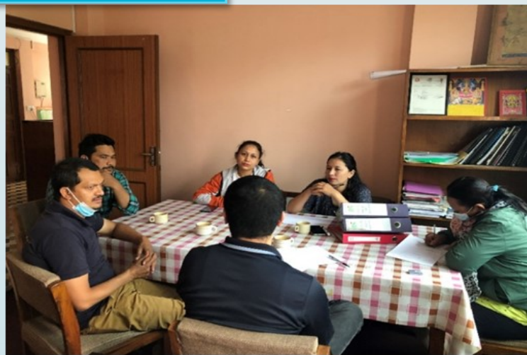
Meeting with F-Skill, Sanepa Team

On May 29th of 2022, CDS Procurement managements team visited F-Skills Sanepa , UCEP and Multi skills training center Bhaktapur for knowing current situations of training center. The main objectives of the visit were to select appropriate vender for vocational training under Building Resilience with Children in Kathmandu's brick Kilns (II) project (BRiCKK II) project and start vocational training from the month of June. The upcoming vocational training is to be given to all the interested candidates for workers from the Brick industry for both 1st and 2nd level training.