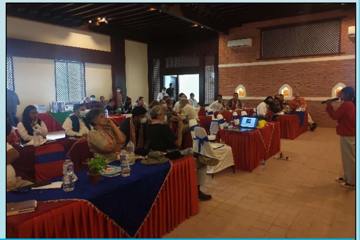
A child sharing her learnings after engaged in the project in front of participants at Kirtipur Municipality