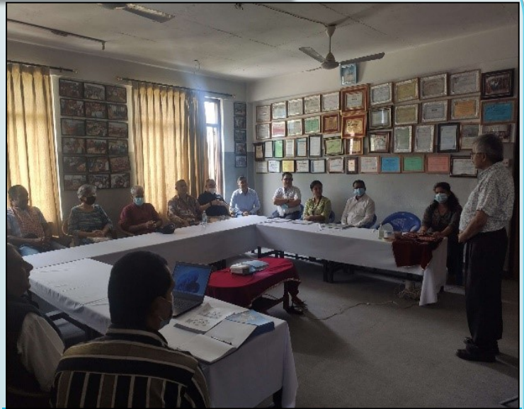
General Secretary of CDS facilitating during WVIN leadership visit at CDS central office, Kapan

With the focus on partnership with WVIN, there was also a sharing from the partnered organization Child Development Society (CDS) and Good Neighbour Nepal (GNN) where major challenges, opportunities and learnings were shared by Executive Director and Program Director of CDS and GNN respectively. Overall facilitation in the program, was done by General Secretary of the CDS.