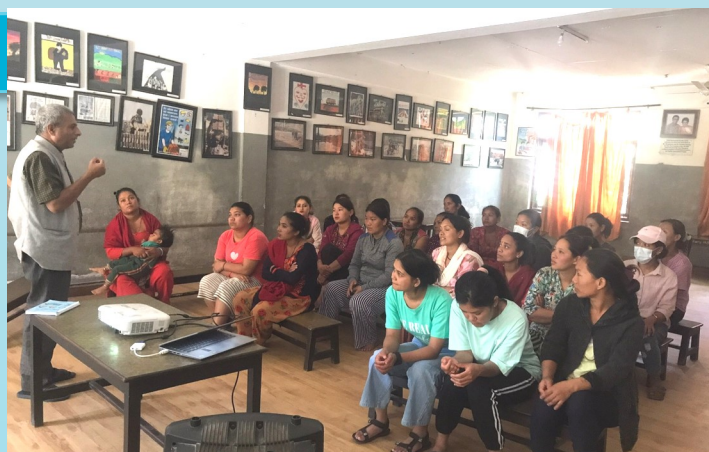
Orientation provided by ED to mothers about SEEP

One SEEP documentary is presented and discussion about the program. Participants are motivated by executive director of CDS and encouraged & interested to engage in SEEP class. This program is planning to conduct two groups in financial support of Rotary Club of Dillibazar and Rotary Club of Australia.