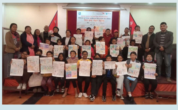
Group Photo With Participants

Three days wall comic story book training has been conducted to Registered Children (RC). Child rights and protection issues of communities were portrayed through a story in wall comic. Through the training, the ground realities of child rights and protection issues are clearly seen which are facing by children in communities. The session was purely a medium to show issues of children's rights and protection. In total 20 different issues were portrayed through wall comic. Menstruation, Trafficking, Junk Foods, Discrimination were the measure issues covered on the comic story.