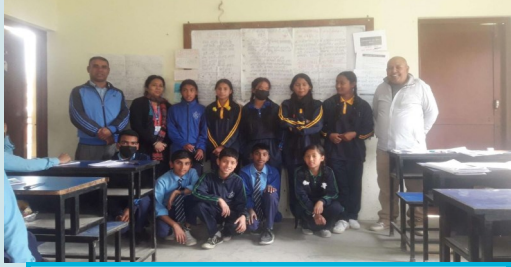
Newly Elected Child Club Members

Kirtipur Municipality's ward no. 2 and 6 have reestablished a child club with the support of Child Development Society and WVI Nepal. The child club's executive members were newly elected, and their roles and responsibilities were delegated to the board positions. CDS provided guidance to the child club members during the restructuring process, emphasizing the importance of child clubs, the transfer of responsibilities, and children's rights. This initiative aims to provide a platform for children to voice their concerns and engage in community development.