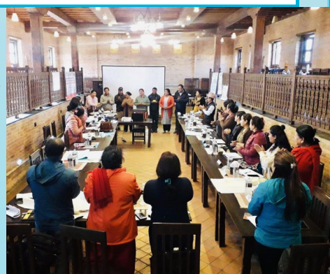
Participants Group Photo, Kirtipur

The Child Rights Committee (CRC) of Kirtipur municipality at both ward and municipal levels, including the head of the Women and Children Department, participated in a three-day training on child protection mechanisms. During the training, the CRC members created a community map to identify how to refer issues related to children, and an action plan was formulated for prompt action by the CRC. The members shared their experiences with the facilitators to find solutions to cases in their locality. The Deputy Mayor of Kirtipur Municipality monitored the training and emphasized its importance in helping the CRC operate at the grassroots level to identify and address child protection and rights issues. This training is cru-