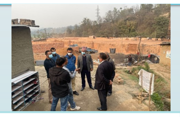
Interaction with Children, Day Care staff and brick industry worker

A team led by Joint-Secretary from the Ministry of Labor, Employment and Social Security visited two brick industries in Lalitpur Ward 22 to ensure compliance with labor laws and regulations, particularly regarding child labor, on March 16, 2023. The team inspected the facilities and found some children playing in the industry area instead of attending school. They also visited the daycare centers at both industries and discussed with parents and children about its benefits. The team inquired about the impact of the BRICKK project on the participants' lives and whether it brought any positive changes.