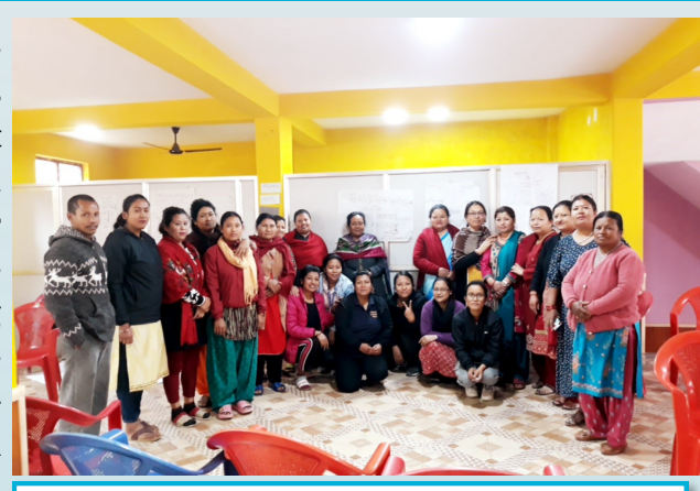
Participants Group Photo, pur

Kirtipur municipality wards 3 and 9, in coordination with CDS, joinly organized eight sessions on positive parenting for the parents of most vulnerable children (MVC). The aim was to build positive skills in parents to better nurture their children. Facilitators used different methodologies to deliver messages on positive parenting skills, such as the river of life, stress management, and communication skills. Parents connected with their childhood memories through these activities and discussed how their own upbringing influences their current behavior as parents. The positive parenting sessions were