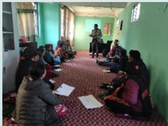
Orientation on CFLG and CRC

Similarly, orientation on disaster risk reduction (DRR) as disaster preparedness was provided in facilitation of Program coordinator of CDS. Simulation drill on DRR pertinent to gathering on safety zone during earthquake was done during the orientation. These orientations will support in achieving CFLG indicators to some extent.