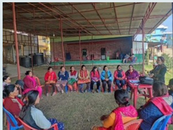
Consulting parents about Rupantaran

Community consultations at Kathmandu Metropolitan city-16 and Kirtipur Municipality have conducted with presence of parents, stakeholders and local government to identify participants for 6 months long rupantran sessions. Consultation meeting was divided into two parts for two clusters; each 5 consultation meetings were conducted in Balaju and Kirtipur. Including graduated participant's parents were participated where they have shared their opinion regarding rupantran sessions and its importance which change their children in positive way.