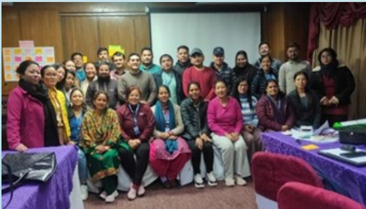
Positive Parenting ToT participants

Three-day training on positive parenting for CDS and WVI Nepal staff, was organized from 29 November to 1 December 2022 in Baneswor, Kathmandu, Nepal. The training was carried out for whole CDS staff and few members of WVI Nepal from child protection and sponsorship department. Main purpose of ToT training on positive parenting was to train CDS and WVI Nepal staff on positive parenting based on positive parenting training manual.