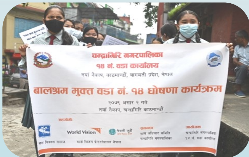
Children were spread the messages about the child labour at ward no.14

Child Labor Free Ward by signing the flex banner. The ward level child rights committee coordinator welcomed all participants and ward members shared the process of child labour free declaration. Chandragiri Municipality has been leading Child Labour Free Campaign for the past 4 years to end child labour. It was meant to closely align with the