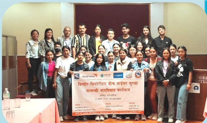
Snapshot in the group after finishing debate competition at Hillside hotel Kirtipur