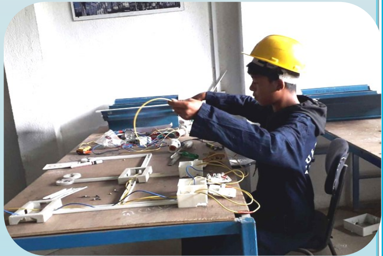
Participants engaged in tailoring and house wiring trade in different training centers