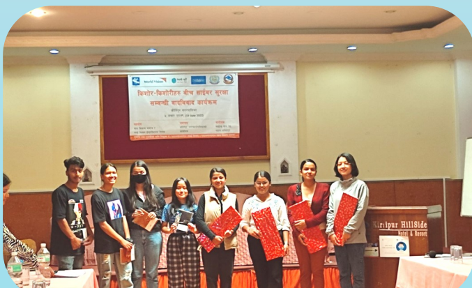
Winner candidates of the debate competition