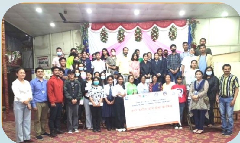
Participants in the city-level children's assembly.