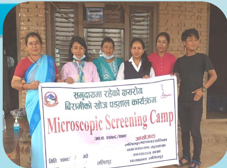
Group picture during the microscopic Screening Camp

In co-ordination with the Lalitpur Metropolitan City and Ward Health Post of ward 22 , tuberculosis screening tests were carried out in four different Brick Industries (Hira Brick Industry, Jai Bhairav Brick Industry, Om Shree Brick Industry and UK Brick Industry) located in the Bungmati Area, Lalitpur. During this Microscopic Screening Program, 115 Brick workers perform their sputum for Tuberculosis screening. As the brick industry itself is a risky and hazardous site for working and as these workers are living under the poorest conditions. There is a high risk of tuberculosis among the workers. Such screening test help to find out the hidden cases of diseases in the worker.