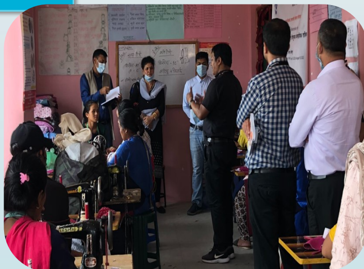
Participants engaged in tailoring practical in F-skills

The Social Welfare Council (SWC) seniors officials have made a monitoring visit to F-skill Training Centre and Om Shree Brick Industry located in Lalitpur Metropolitan City's Ward 22. Furthermore, SWC team also visited Kirtipur Municipality ward no. 7 where the Rupantaran Session is regularly conducted. The teams including SWC, WVIN and CDS engaged in an interactive discussion about the advantages of the project interventions with the vocational participants and the beneficiaries of project and discussed about the sustainability of the project in the brick industries.