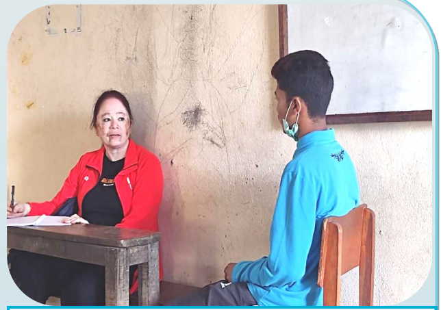
A picture of a child being given counseling.