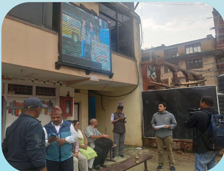
CDS Program officer briefing about the use of the LED outdoor display board highlighting.