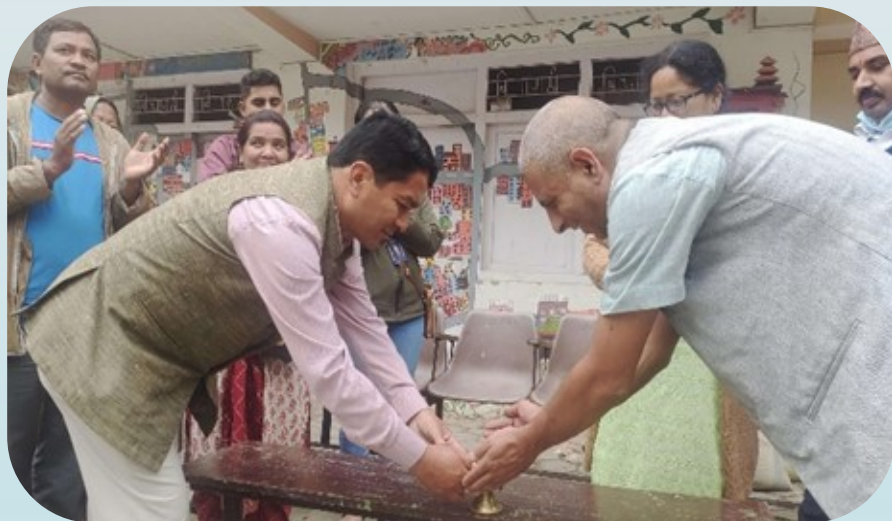
Inauguration of LED Outdoor Display Board formally by the former Chairperson of Ward-8, Kirtipur.

The Executive Director and the Program Officer from Child Development Society (CDS) and representative from the Good Neighbours Nepal both actively engaged in this formal program. The CDS Program Officer had given information regarding the use of the LED outdoor display board, highlighting the function and accountability of CDS, GNN, and Ward 8 Kirtipur Office. CDS and GNN have provided support to establish an LED outdoor display at the request of the ward office.