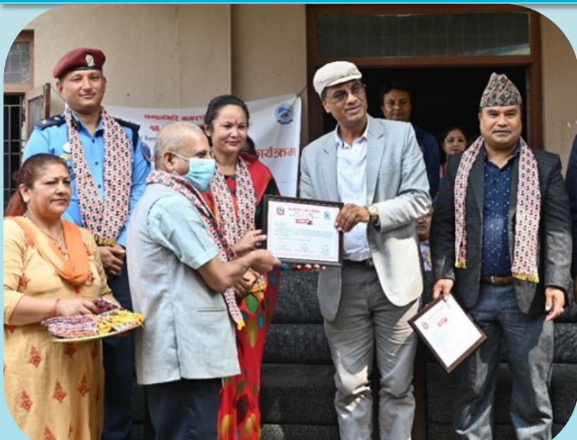
Mayer of the Municipality handed over the letter of appreciation to CDS

Chandragiri Ward-14 was declared the 1 st child labour-free ward of Chandragiri Municipality on June 16 2022. The declaration program was chaired by officials such as:- Ward Chairperson, in presence of the Mayor and Deputy Mayor of the Municipality, Deputy Mayor, Deputy Superintendent of the Police, Chief Administrative Officer, Chiefs of Social Development and Education Unit of the Municipality, Executive Committee Members, Child Rights Committee Members, Chil-