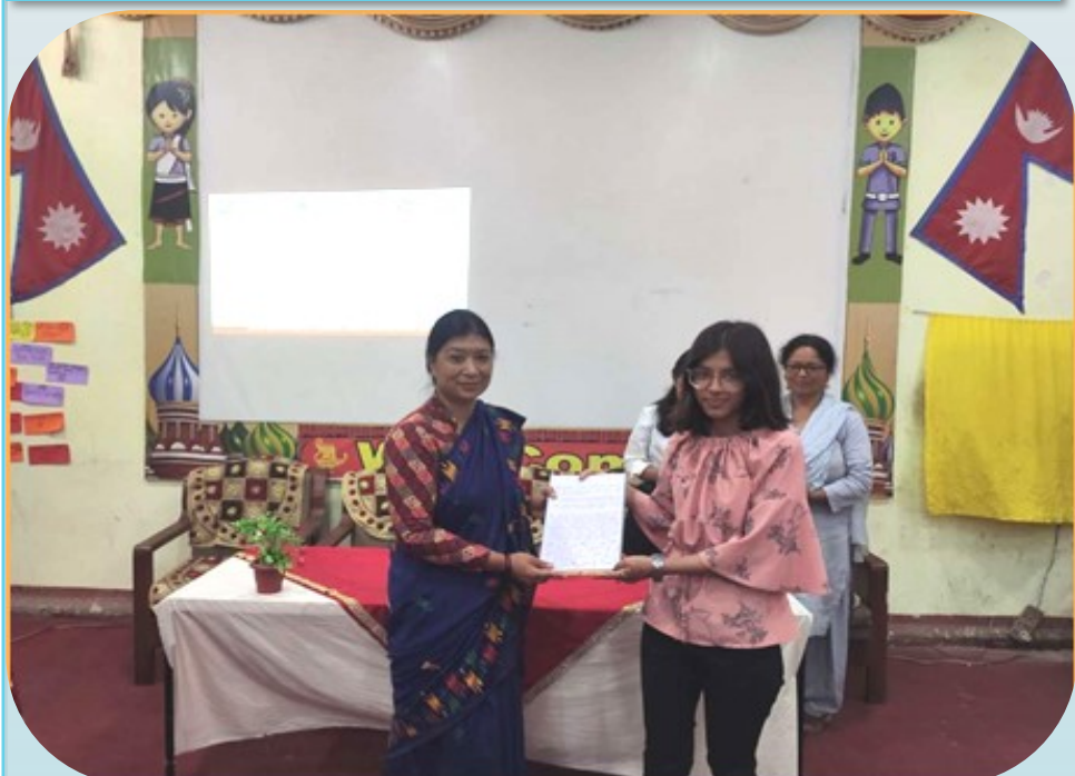
Handover to the Deputy Mayor of the prior plans prepared by children for the fiscal year 2079-2080.