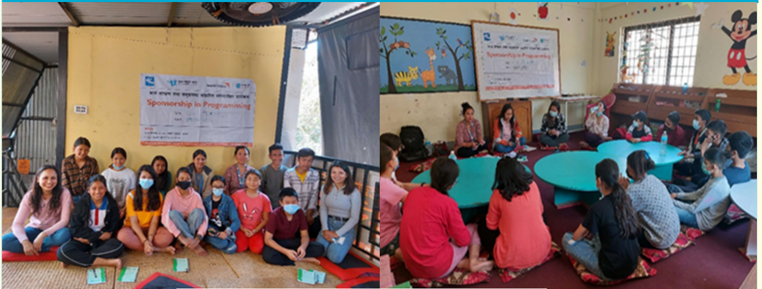
Children participating in FGD Session

Under the PCESP project, 2 Focus Group Discussions (FGD) were conducted with adult group of Registered Child's parents and an IG group. 2 Focus Group Discussions (FGD) were conducted with RC and Non-RC, Rupantaran session children, and Child club members. The main objective of conducting FGD was to enhance the quality of sponsorship program and create a better impact on children's participation. It further encourages community people to take ownership of the initiative.