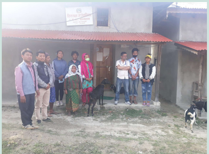
Goat farming as a livelihood support alternative

During the reintegration process, CDS coordinated with National Child Right Council, Chandragiri Municipality, ward no. 14 Naikaap, Lalitpur Metropolitan City-22 ward office for the formal letter from the government office and Nepal Police Station.