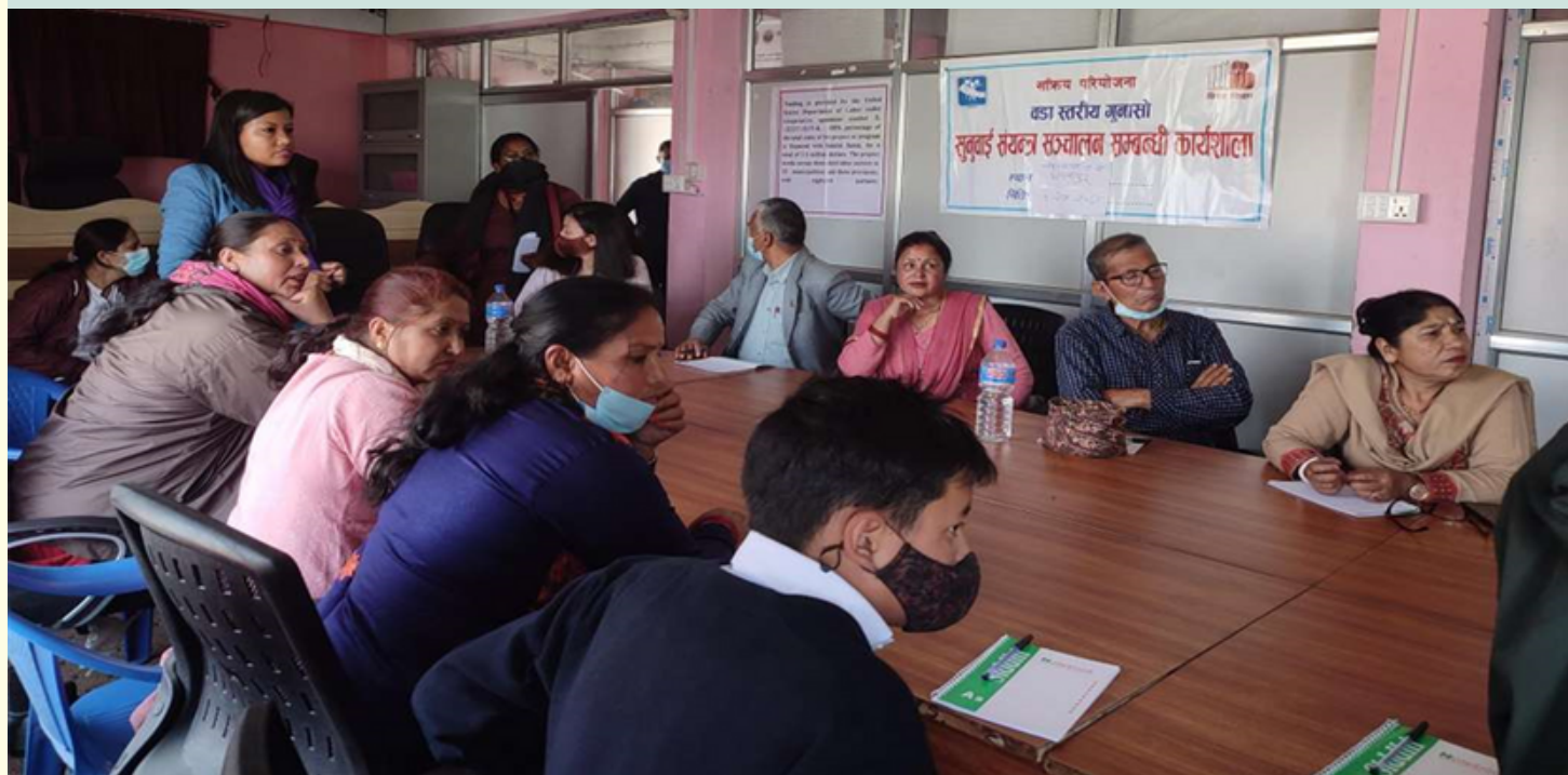
Participants of WCRC attending the Grievance Mechanism Orientation Program

CDS organized Grievance Mechanism orientation program in Changunarayan Municipality to all WCRC members of total 9 wards, with 3 events on 15th, 16th and 18th March.2022