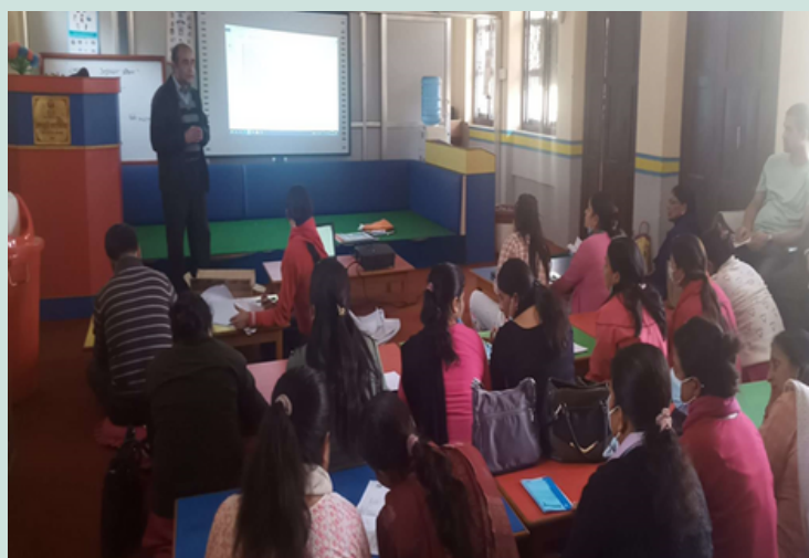
Participants in positive discipline trainings

Two trainings on positive discipline have been conducted at Tarun School and Siddhi Ganesh School of KTM -16. This was mainly focused on school teachers, and it was facilitated by teachers who had already taken TOT training from the CDS/WVIN. The main objective of the training was to make them understand the meaning of positive discipline,, teachers' roles and responsibilities, tips for understanding of students' behaviour, how to be a child-friendly teacher, etc. So far, 86 teachers have received this training from the 2 events.