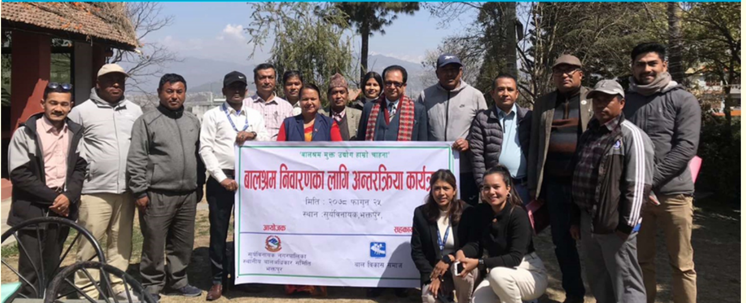
Stakeholders as participants of interaction and elimination of child labour from Brick kilns of Surya Binayak Municipality

The Child Development Society organized an interaction program on- 9th March, 2022. The objective was to share the ' research findings on child labor and reducing child labor ' from Brick Kilns of Surya Binayak Municipality.