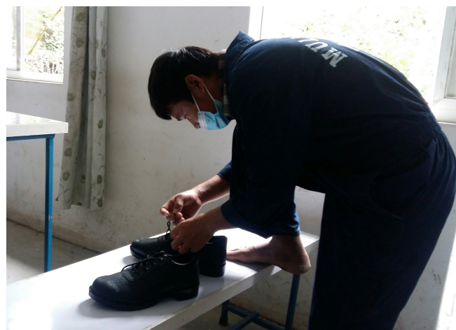
Trainee puts his new safety shoes on.

Similarly, training for multi-skill house wiring is held at Naya Thimi, Bhaktapur. The purpose of providing safety shoes is these pair of shoes are perfect when working in high risk and hazard prone places of work.