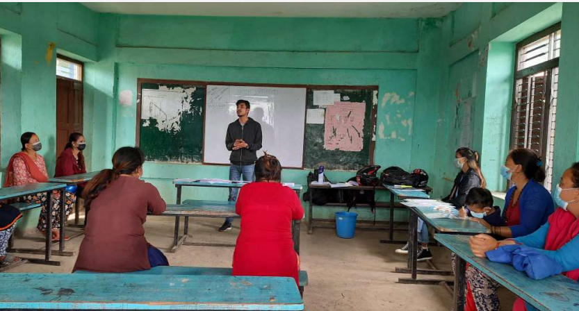
CDS field facilitator gives an orientation to parents' of new beneficiaries