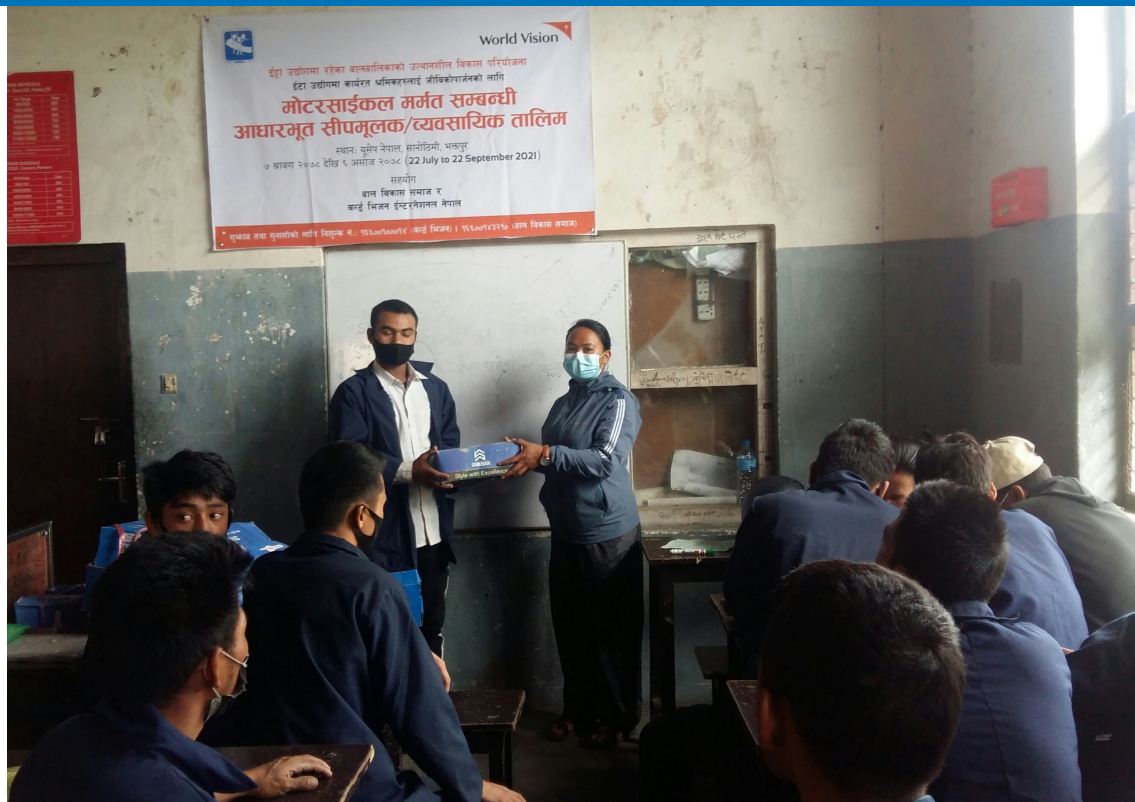
Safety shoes were handed over to the trainee participants.