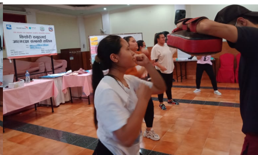
SELF DEFENSE SESSIONS