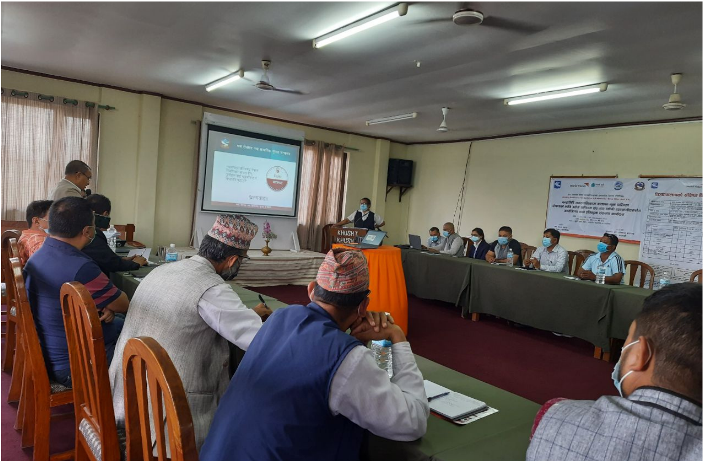
Representative heads from Chandragiri Municipality, Federation of Nepalese Chambers of Commerce and Industry, supported by CDS and WVIN , exchange dialogue to make collaborative commitment against child labour