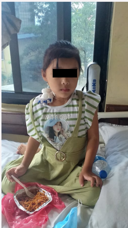
A registered child supported with cash Rs 40,000/- for medical treatment.

Medical treatment support was provided to two of the Registered Children (RC) beneficiaries. One children had been suffering from fever and a spot seen in the chest when done X-ray. While, the other suffered from fever, weakness, and diarrhea who was later admitted in ICU for further treatment).