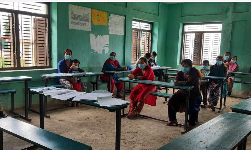
Parent participants of the newly registered children