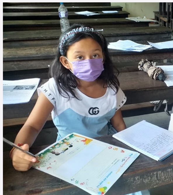
A registered child writes an intro letter to her sponsor

One event of Child Monitoring Standard review meeting with Community Based Organization and community conducted at ward 4, Kirtipur. Two of the children have been admitted to school and one is in process for admitting to school.