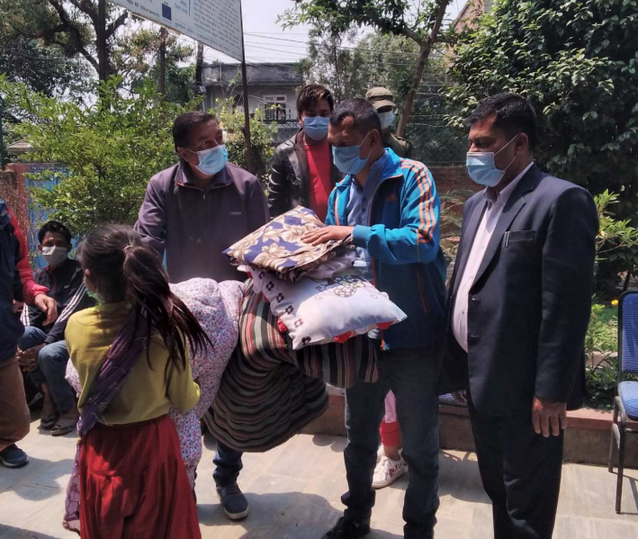
Food and bedding set distribution program