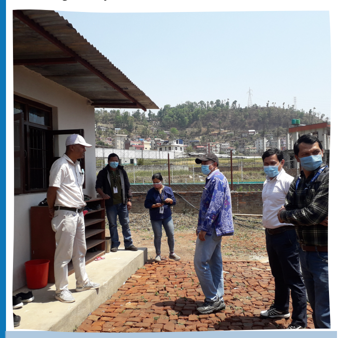
Monitoring and evaluation in Brick Industry

The street drama was focused on giving the awareness about the preventive measures services provided by the Government of Nepal, and all the safety measures which should be applied to prevent the COVID-19. It also showed the glimpse on the importance of documentation and social protection which developed the environment of revision to the workers as they were given various orientation on these topics by CDS.