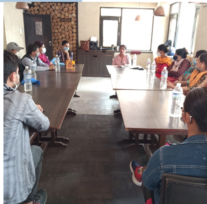
Child Monitoring Standard orientation at KTM-16-Balaju

In the month of April, eighteen children have been registered as registered Children (RC). Similarly, total five Child Monitoring Standard orientation achieved this month. Two were conducted at ward 8 & 9 of Kiritipur Municipality while three were conducted at Paknajol, Khusibu and Bypass clusters of Kathmandu Metropolitan City ward no. 16. RC Parents, School Representatives, Youth Club Representatives and Female community health Volunteer (FCHV) were the participants for orientation who will play a prominent role in child monitoring at their respective clusters.