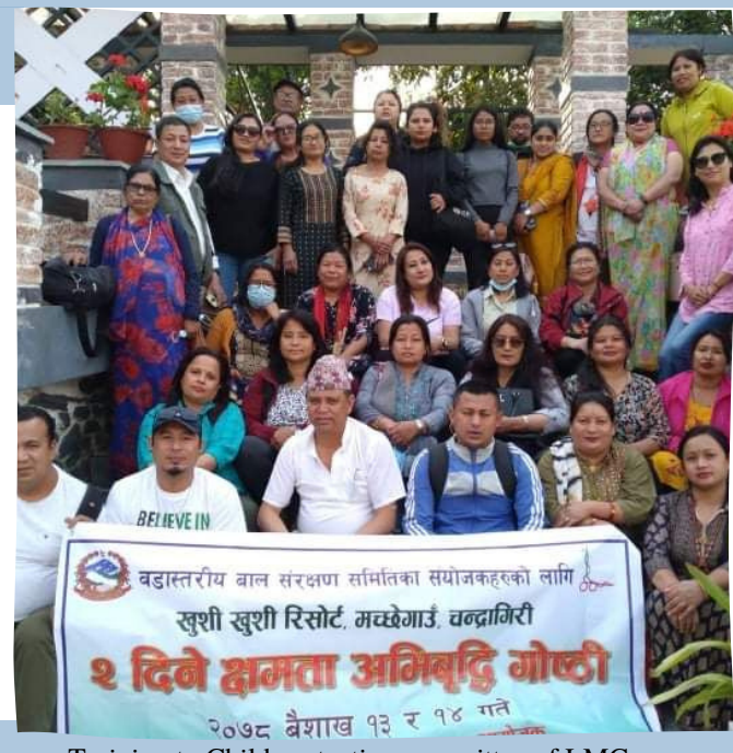
Training to Child protection committee of LMC

Similarly, Lalitpur Metropolitan City organized two training to child protection committee days coordinator of Lalitpur Metropolitan city (LMC) concentrating on child rights, role and responsibility of child protection committee as well as case management system. Urban Environment Management Society (UEMS), Child Workers in Nepal (CWIN), YUWALAYA, CDS and Voice of Children (VOC) supported financial resources to make this program successful.