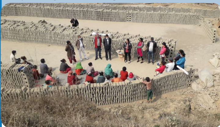
Orientation on sponsorship approach to RC & Non RC families