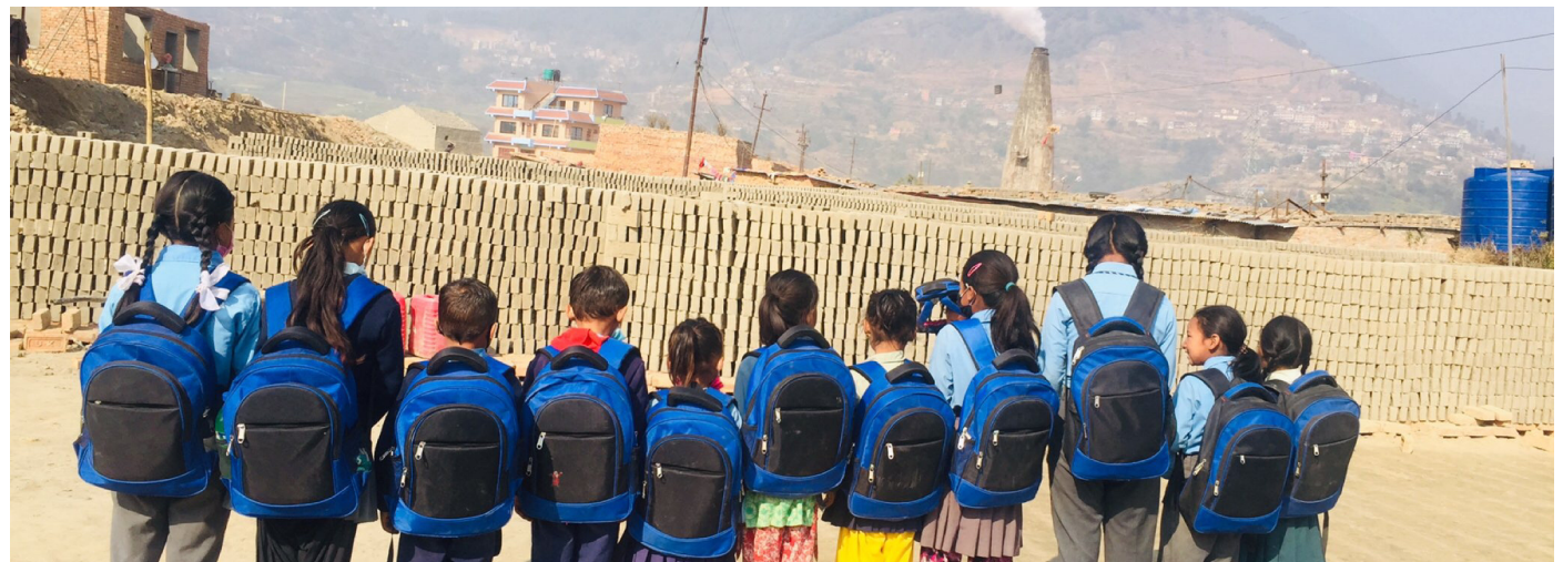
Monitoring visit to brick industry of Chandragiri municipality Children of brick industry after the school support materials.