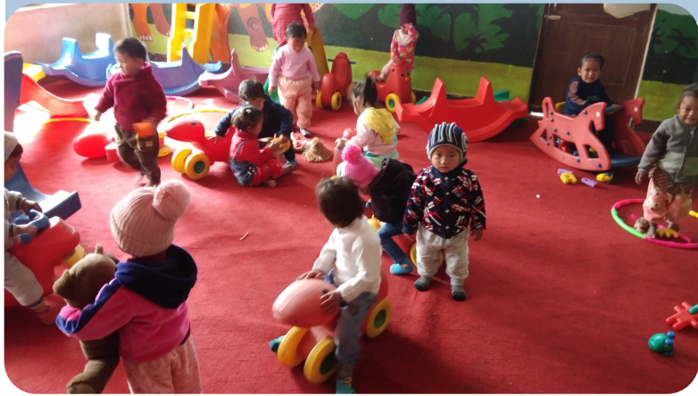
Children at day care playing with colors