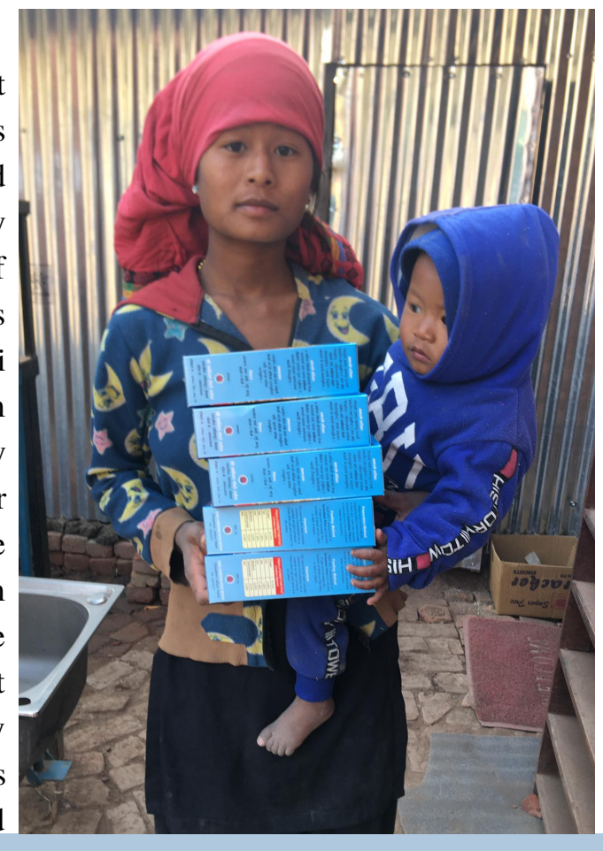
Mother and child after the distribution of super flour

Under the brick project, a joint monitoring visit at day care center of Brick Industries was conducted on February. As per observed and interactive sessions by monitoring team lead by Deputy Mayor including senior officials of Chandragiri Municipality and representatives from WVIN and CDS during visit to Balkumari Brick Industry at Ward No. 14 and Om Himalayan Brick Industry at Ward No. 3. They thanked CDS and Brick Industry owner for building a structure for day care centers in the premises of the industries. The monitoring team observed that the management of both day care and found centers was good out beneficiaries (children and parents) are happy with project intervention. The main objectives of the day care center is to support in child wellbeing.