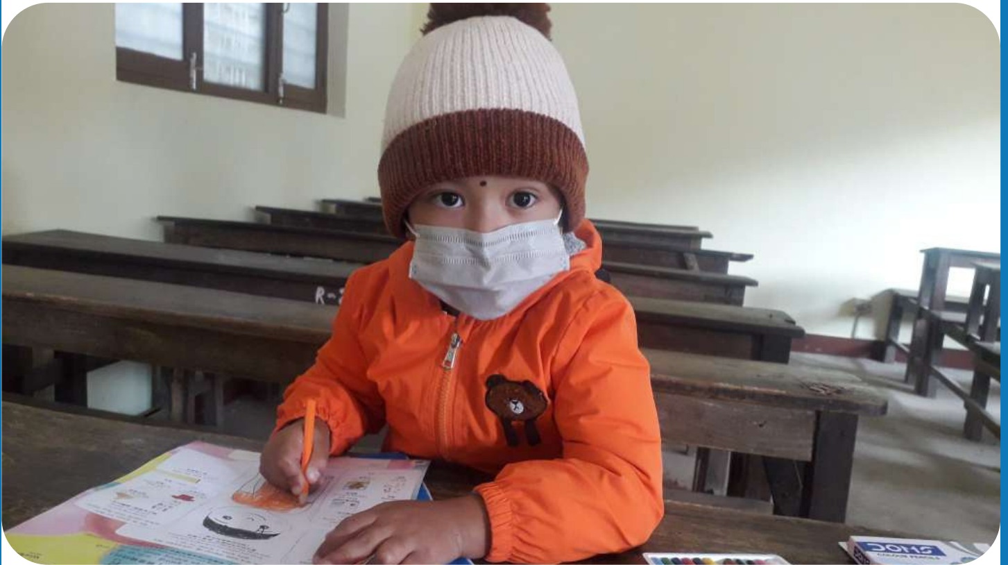
A child participating in child expression worksheet (CEW)

Altogether 1,036 Registered Children (RC) monitoring (physical-553 and virtual-483) has been done within this month. Similarly, bulk messages relating COVID-19, critical health issues, migration and accident were disseminated to 4,893 RC families. A registered child under urban development project, who suffered from appendicitis and had to go for operation, the project provided NRS 30,000/- for the support which will help to cover his operation charge, medicine expenses and other emergency expenses.