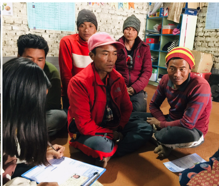
Workers of Brick industry opening saving account