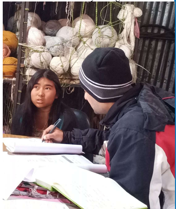
Collecting data in carpet industry of ward 8, Gokarneshwor Municipality.

Under the sakriya project, CDS conducted Community Based Advocacy & Research Assessment in carpet industries of 8 wards of Gokarneshwor Municipality. Data collection of children, parents and owners of carpet industries has been completed and data cleaning, verification and analysis is carried on. Interview and care plan of 13 children of Suryabinayak Municipality has also been completed for the Case Management. The action plan of Changunarayan Municipality and Suryabinayak Municipality through round table discussion with the support of Tdh has also been prepared.