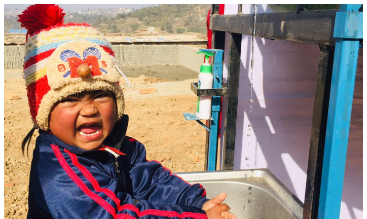
A child enjoying while washing her hands

CDS initiates to make better livelihood for children and vulnerable group of people and is progressing day by day. As the day care center in 8 brick industries has been started, the distribution of winter clothes has also been accomplished. Similarly, child friendly hand washing corner has also been placed in all the brick industries. CDS team has also found the drastic positive changes on children and their growing portfolio after their regular presence at daycare center. In other hand, their parents who are the workers at brick industries are also happy and has been giving their 100% focus on their work without worrying about their children.