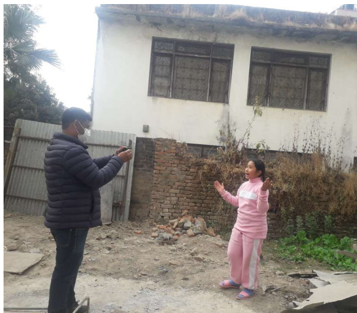
In making of child updated video