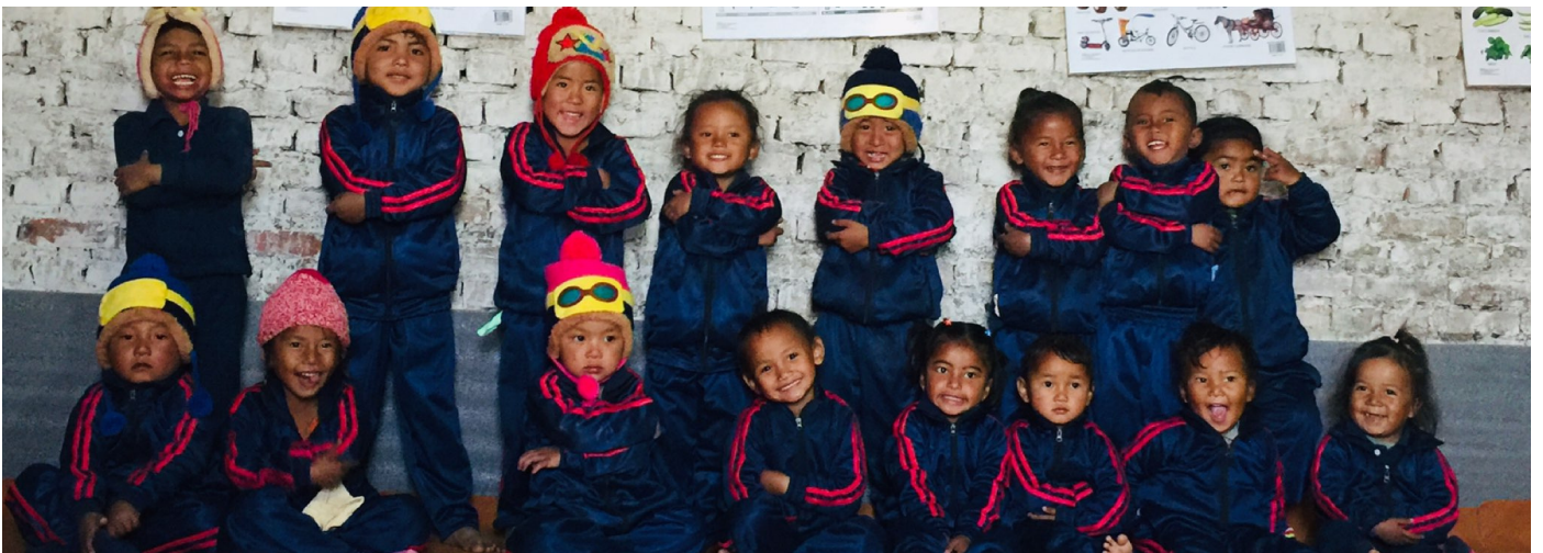
Mayor of Chandragiri Municipality addressing in review meeting regarding child labour elimination plan. Children of day care center at a brick industry in track suits and caps supported by CDS.