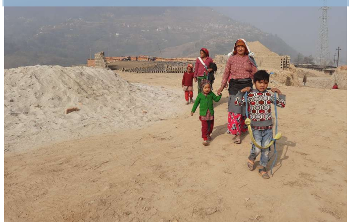
Mothers taking their children to daycare