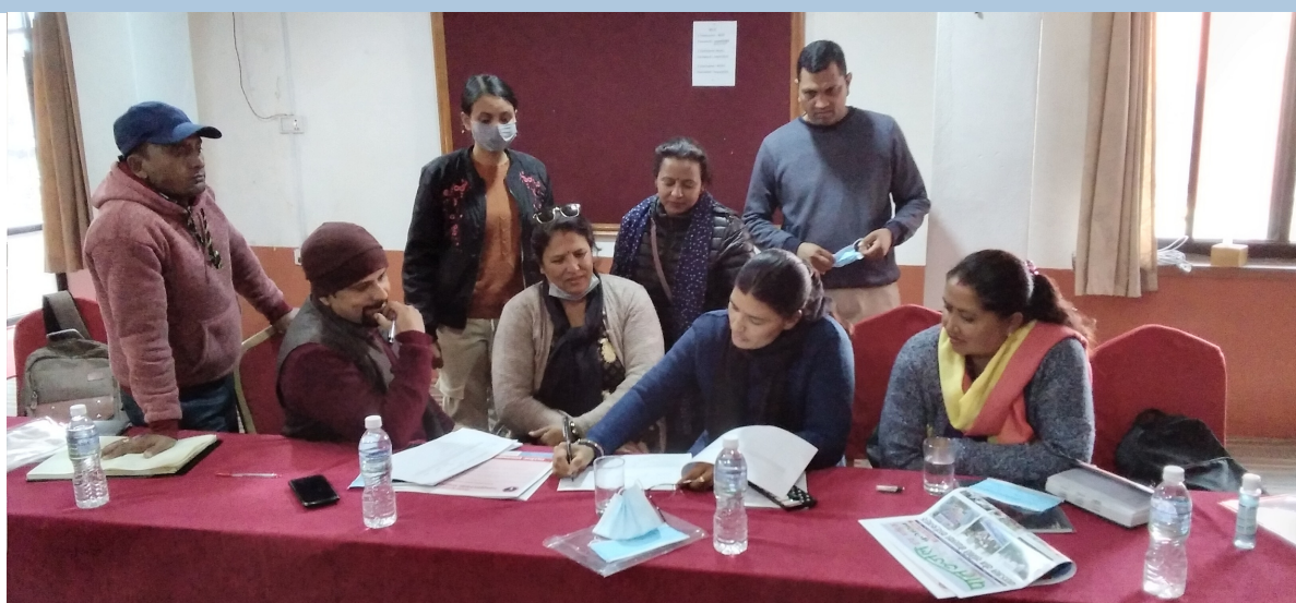
Preparation of action plan for the elimination of child labour at Changunarayan and Suryabinayak Municipality.