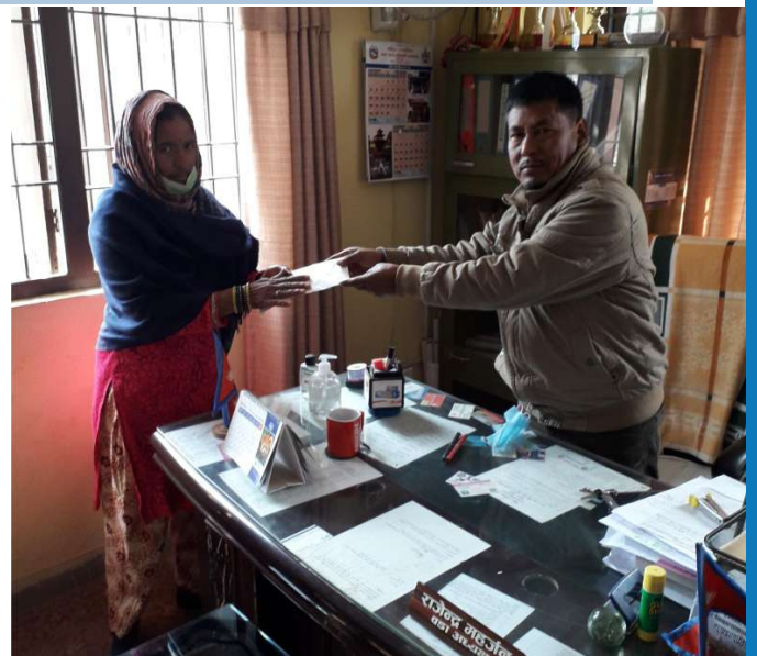
Handed medical support by Ward-3 Chair Person of Kirtipur Municipality to the mother of RC child.

CDS is conducting an activity themed 'self esteem' among RC to expand their creativity through child expression worksheet. Around 837 Child Expression Worksheet (CEW), 550 Child Updated Photo (CUP) and 250 CUV (Child Updated Video) has been completed within this month. In the process of providing information, five orientations on sponsorship approach have been provided to RC & Non RC families.