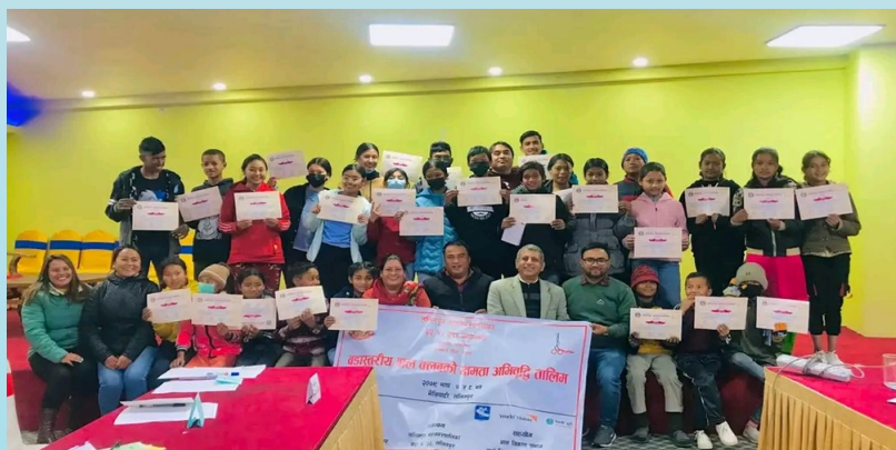
Group Photo with Participants, Lalitpur—22

A similar 2-day capacity building program was held for the ward-level and school-level child clubs network in Lalitpur Metropolitan City- 22. The event was organized by the child rights committee in collaboration with CDS and WVI.