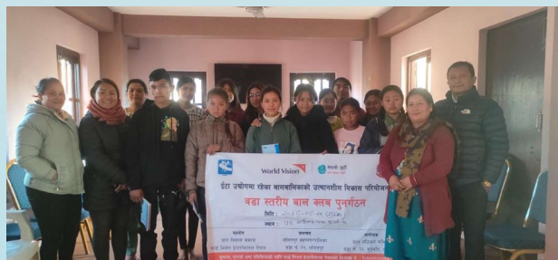
Newly Reformed Child Club, Ward 22, Lalitpur

On January 6, 2023, the Child Development Society and World Vision International Nepal facilitated to reform of the child club network in Lalitpur Metropolitan City Ward 22. A network of 17 members was established, with 4 members from brick industry worker families. CDS and WVI Nepal provided technical support during the reform, discussing the basic concept of the child club network and the roles and responsibilities of its members. Another child