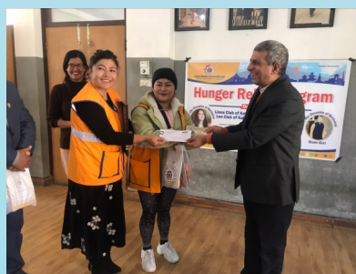
Glimpses of Support Event at Day Care Center, Kapan

The Lions Club of Kathmandu Subha Aarambha supported 40 children at the Day Centre in Kapan on January 24, 2023 by providing them with stationery materials. They also provided a day meal for a day care center run by the Child Development Society (CDS) in Kapan, Buddhnilkantha.