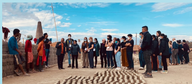
Discussion with Brick Kiln Worker

The students from Sydney University and Kathmandu Schools of Law visited a project site of the Child Development Society (CDS) located at a brick kiln in Bungamati. CDS, in partnership with World Vision International Nepal (WVI Nepal), is working towards eliminating child labor in the area. The students had a discussion with workers about their daily lives and reasons for working in the kiln. They also spoke with the day care facilitator about the operation and management of the day care center run by CDS and WVI Nepal. After the visit, the students generously donated NPR 10,000/- to support another day care center run by CDS, at Kapan, Budhanilkantha.