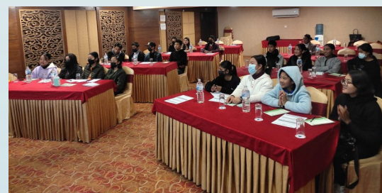
Participants at Training Session

led discussions on child rights and protection mechanisms on the first day and roles and responsibilities of child club members on the second day. The ward chairperson and the executive director of CDS handed out certificates to participants at the end of the program, expressing their appreciation for the collaboration and hope for future partnerships in the children's sector.