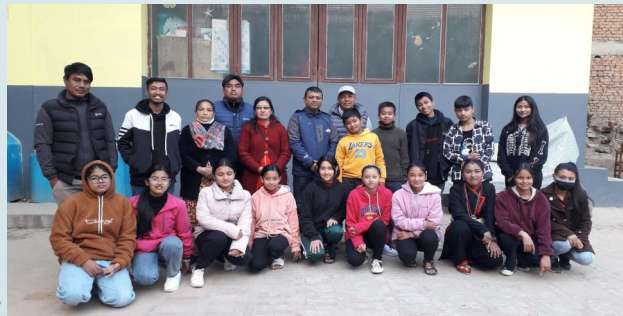
Child Club Reformation, Ward 3, Kirtipur

Kirtipur Municipality ward no. 3 and 9 have reformed a ward level child clubs in facilitation of Child Development Society and WVI Nepal. Child clubs have come up with new executive members through elections. And, the previous Child Clubs handed role and responsibilities to the newly elected members of the child clubs. During reformation of child clubs, CDS staff have facilitated members of child clubs on the basic concept of child club's importance and process to handover the role and responsibilities of the clubs.