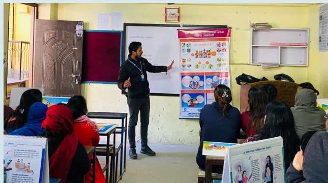
Sponsorship Orientation, Boharatar

Orientation programs have been conducted in Kirtipur Municipality ward 8 and 10 and Kathmandu Metropolitan city-16, Balaju to raise awareness and capacitate community members, teachers, community organizations and registered children about child monitoring. The orientation program also aims to make participants aware of the sponsorship approach and its importance in ensuring child well-being from the community level. These programs aim to provide a common understanding of the CDS and WVI Nepal child sponsorship approach and its role in promoting sustainability and fairness in project activities. The orientation is aimed at promoting child monitoring at the community level and providing support for child well-being.