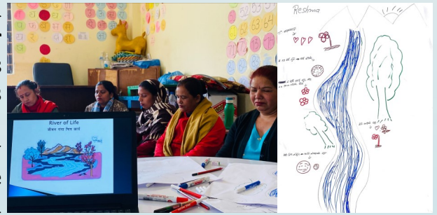
River of Life exercise with parents

A day-long session on positive parenting was held at Nepal Yubak School in Kathmandu and Kirtipur Municipality Ward-2. The aim of the session was to equip parents with positive parenting skills and to support them in nurturing their children. The facilitators used various methods to convey the messages of positive parenting, such as the river of life and skills for managing stress and communicating effectively. The session provided an opportunity for parents to reflect on their own childhood experiences and examine their current parenting practices. Through discussions and activities, the parents reconnected with their childhood memories and considered the differences between their own experiences and their current parenting behaviors. The session aimed to foster positive growth and development for both parents and their children.