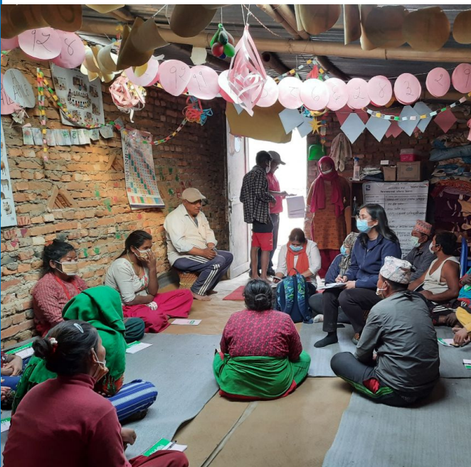
OSH meeting at Brick Industry

Similarly, 9 events related to occupational safety and health (OSH) program in all 8 brick industries was conducted in coordination with The Ministry of Labour, Employment and Social Security (MOLESS). CDS is taking initiation to support to maintain the standard of working environment as one of the objectives of government is to cover the SDG goal under the "Decent Work And Economic Growth" During the program, the topic of discussion was on the problems and missing facilities which should be provided by the owners in the Brick Industries. As the problems were identified, owners of all the brick industries has shown the commitment to solve all the problems by providing the facilities like easy access to water with proper sanitation around the surroundings and also by providing the gloves.