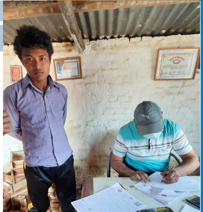
Access To health insurance to Brick Workers.

Under the brick project, The orientation on health insurance were organized by CDS in coordination with Beema Board to the workers of Brick Industries. As the workers in brick industry have a haphazard life style and to suppress the enormous financial burden for health and care, the orientation was conducted. After that process, access to health insurance to brick workers of Sindhuli District was successfully conducted. Total 58 numbers of family which includes 261 individuals were supported for the access to health insurance. They were really happy to get the service and acknowledged CDS and WVIN for this initiation.