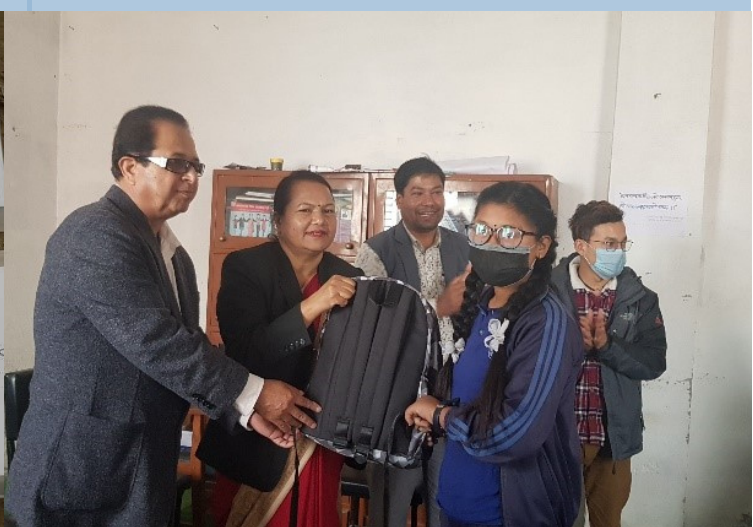
Principal of Bhubhaneshwor school providing support