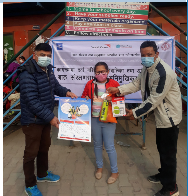
Distribution of message able Sponsorship Calendar

Community Engagement and Sponsorship Project(CESP) has also supported one RC with amount of NRS 12,037 for medical purpose who had a skin related health issues this time. She is under medication at the meantime.