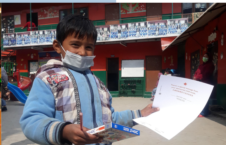
A child ready for Child Expression worksheet (CEW)