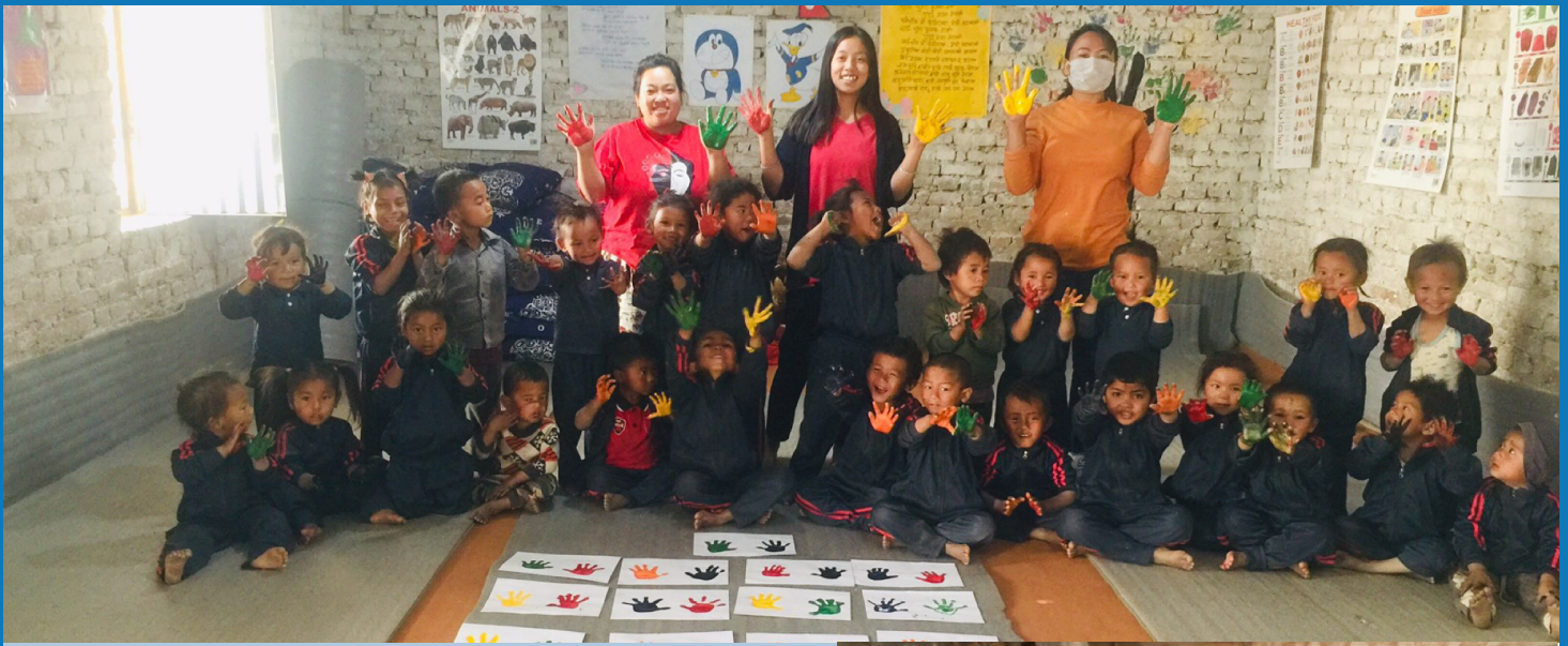
Holi celebration at Daycare center of UK Brick Industry.