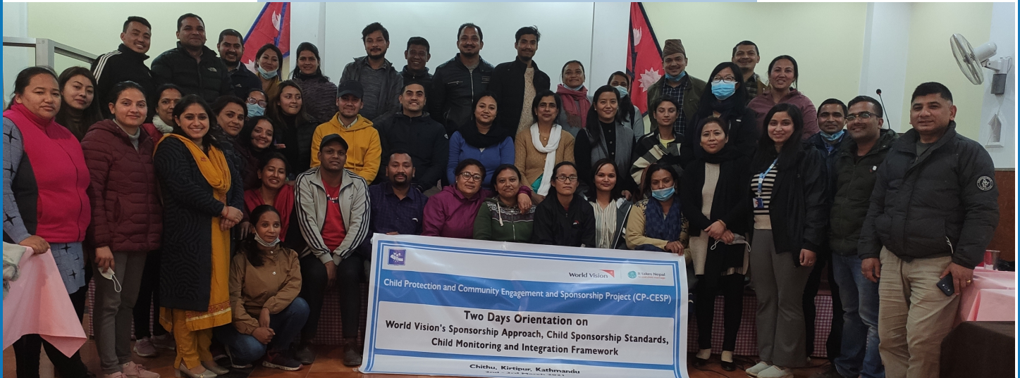
Two days orientation on WVINs sponsorship approach, child sponsorship standards, child monitoring and integration framework.

Two sponsorship orientations provided to Registered Child (RC) and Non Registered Child families at project areas within this month. One event was conducted at Kirtipur Municipality while one was at ward 16, of Kathmandu Metropolitan City. The objectives of the event were to make all the participants to understand about sponsorship program and its effective implementation by mobilizing local community people.