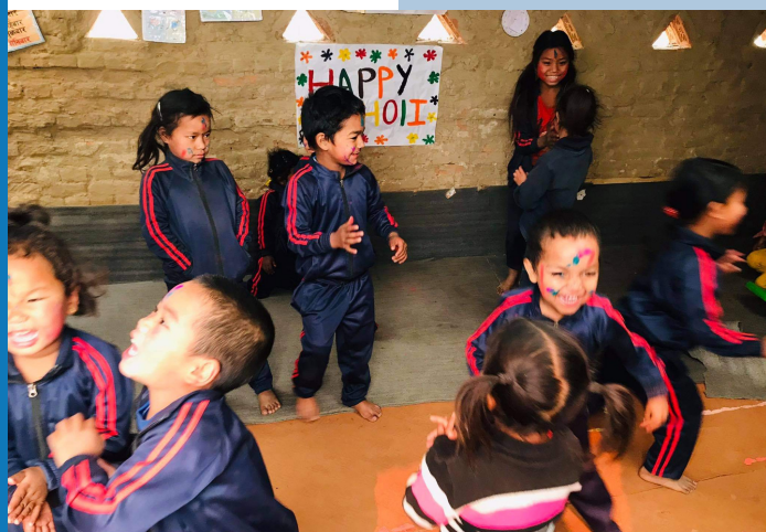
colorful holi in day care center